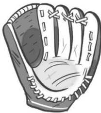
Baseball glove $26.50