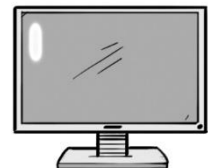
Computer monitor $29.95