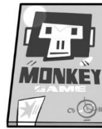
Video game $12.30