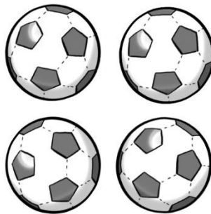
Soccer balls $99