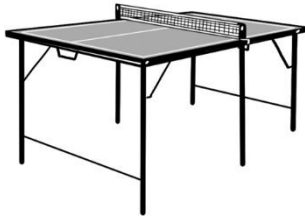
Ping pong table $251