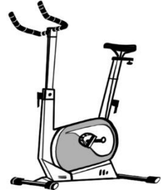
Exercise bike $349