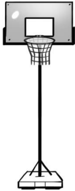
Basketball hoop $387