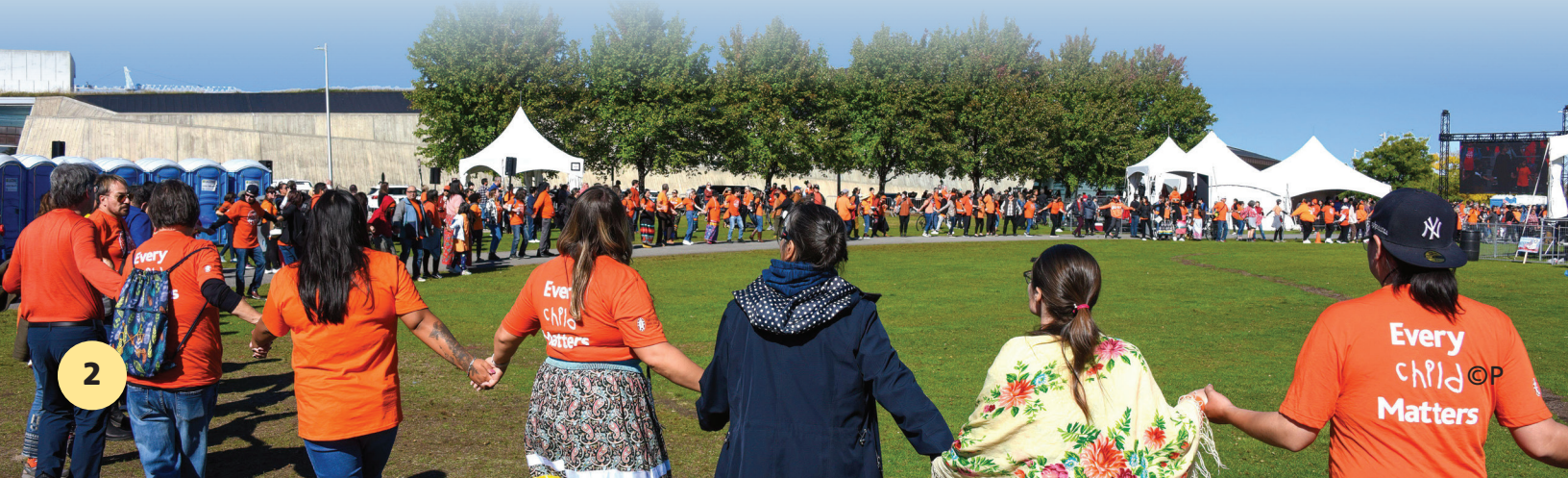
A round dance during National Day for Truth and Reconciliation