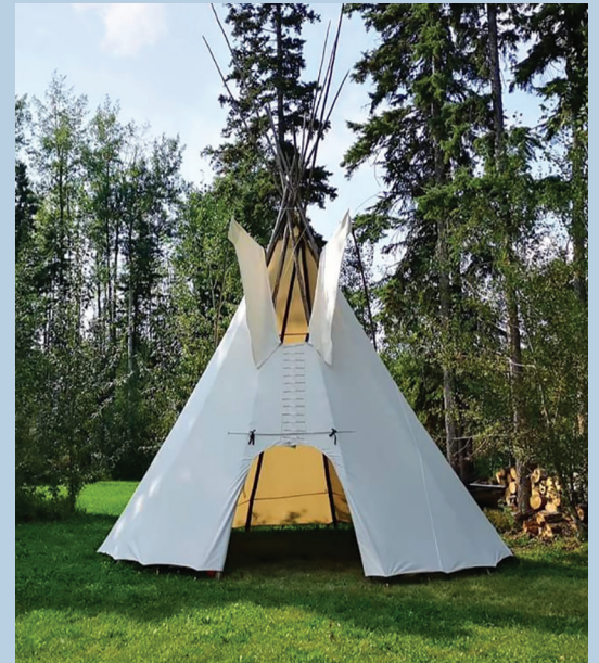
A Nehiyaw tipi

Gatherings called powwows also include dancers who move in a clockwise direction, to the sounds of drum songs. Powwows are held within a circular structure called an arbour. Drums encircle the powwow space.