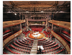
▲ A theatre in the round