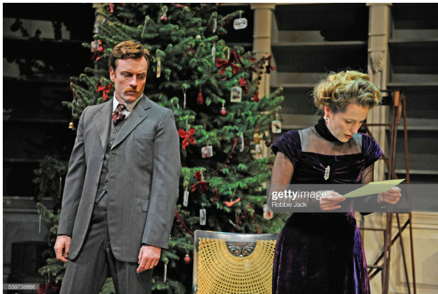
Ibsen's A Doll's House .

We will examine these elements in detail later in this chapter in our areas of exploration section. In this section you will have the opportunity to apply the concepts of dramatic convention and the subsequent expectations for you as a reader of drama. You will also expand your understanding of the three approaches, or lenses of analysis, that you will encounter in this course along with the seven conceptual understandings that provide a sense of continuity as you move from one text to another, from one form to another. These seven concepts establish a framework for comparative observations of texts within a form (two plays) or of texts in differing forms (a play and a poem).