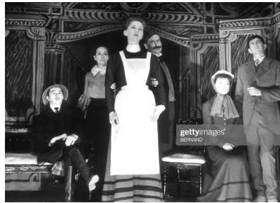
The Bald Soprano.

Theatre of the absurd, a term coined by dramatist and critic Martin Esslin, refers to a non-realistic form of drama. Characters, staging, and action all run counter to our expectations of realistic drama. The world of the absurd is peopled with confusion, despair, illogicality, and incongruity. Action is frequently repetitive or seemingly irrational. Characters are often confused, and metaphysical themes tend to reinforce that the world is incomprehensible. Ionesco's The Bald Soprano and Beckett's Waiting for Godot are well-known plays of this form. Texts of this type connect to the concept of representation as they challenge our perception of reality.