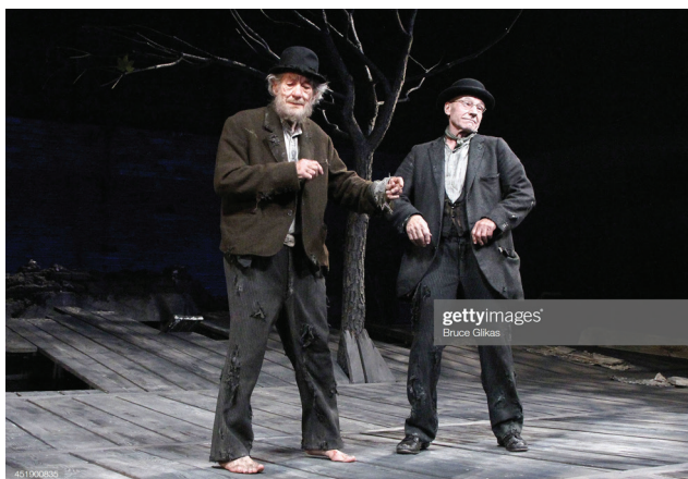
Waiting for Godot.