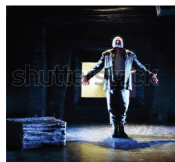
▲ Dramatic action can be the fulfillment of rising tension, or can create new tensions in itself.