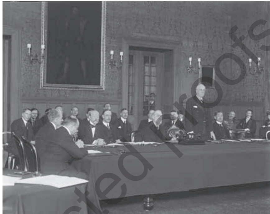
Figure 2.1 Delegates from dozens of countries convene at the League's inaugural General Assembly in Geneva, 1920

After the First World War, the world pinned its hopes on a bold new experiment in peacekeeping – the League of Nations. In Europe, this organization sought to replace the old ways of secret alliances and war with collective security and international cooperation. It also strove to provide a fairer organizational structure, where inclusivity and authority was balanced between all member states in its Assembly, and in its smaller Council, which was led by the great powers . This chapter examines how the League achieved notable successes in the 1920s by settling disputes and fostering dialogue yet also faced mounting challenges as nationalism and unresolved tensions grew. From early triumphs like the peaceful resolution of the Åland Islands dispute (1921) to serious crises such as the Italian aggression in Abyssinia (1935), the League's story in Europe is one of prominent ideals colliding with harsh realities. The League's mixed record reveals much about the interwar period. It highlights the era's historical significance: the first attempt at global governance, the limits of international law without great-power commitment, and ultimately how the League's collapse paved the way for another world war.