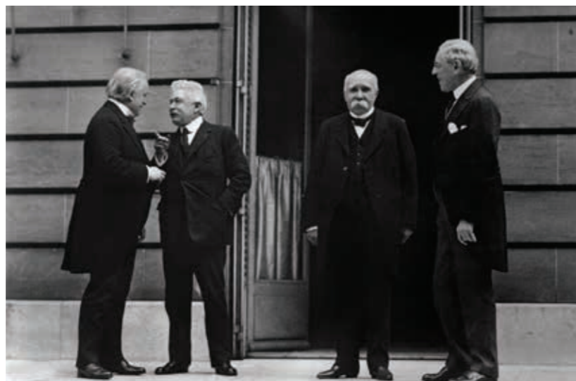
Figure 2.2 The 'Big Four' world leaders meet at the First World War Peace Conference in 1919

The League of Nations emerged from hopes for a more peaceful world after the devastation of the First World War. US President Woodrow Wilson championed the idea of a league of nations in his Fourteen Points (January 1918) to prevent future wars. At the Paris Peace Conference in 1919, the victors of the First World War – the 'Big Four' of Britain, France, the United States, and Italy – agreed in principle to create this new international organization. A commission to draft the League's Covenant was established, and by April 1919 the Covenant of the League of Nations was incorporated as Part I of the Treaty of Versailles. On 28 June 1919, 44 states signed the Covenant, and in January 1920 the League officially came into existence as the first worldwide intergovernmental organization devoted to peace.